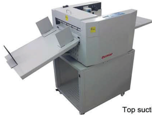
Top suction pile feed (shown with optional stand)